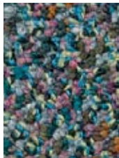
7974 Rap Delight