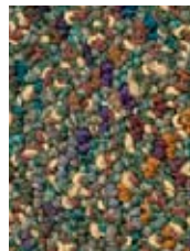
7688 Contemporary Mix