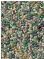
7846 Pop Bee-Bop