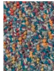
7565 Techno Retro