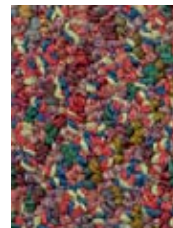
7485 Hippy Hop