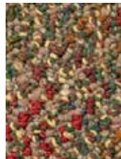
7877 Reggae Jive