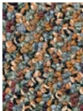
7869 Classical Jazz