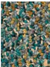
7568 Blues Rave