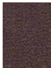
1889 Tooled Leather