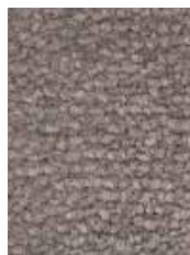
1773 Hammered Tin