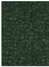
1554 Ficus Green