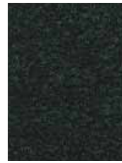
1559 Mystic Turquoise