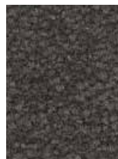
1778 Industrial Grey