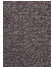
1666 Gunmetal Steel