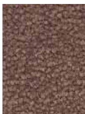
1885 Craft Paper