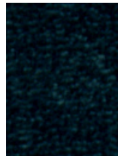
1558 Emerald Forest