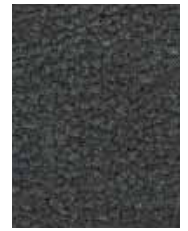
1660 Herbal Teal