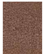
1883 Camel Flax