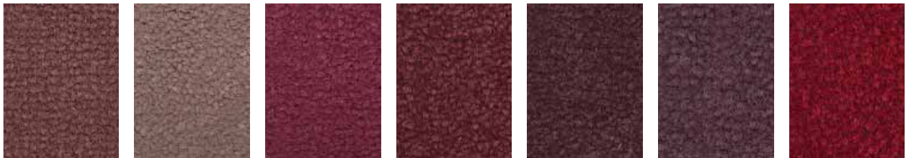
1002 Antique Rosewood 1003 Cameo Foil 1006 Mesa Rose 1007 Cavern Clay 1009 Raisin Swirl 1113 Violet Haze 1114 China Berry