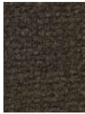
1555 Mossy Olive