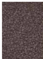
1775 Iron Cast