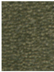
1553 Terra Cactus