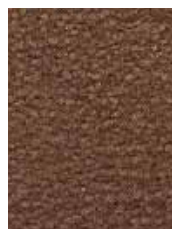
1887 Desert Ochre