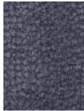
1663 Water Color