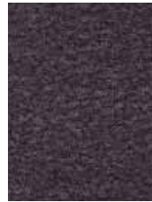
1665 Slaten Strata