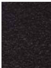
1779 Matte Char