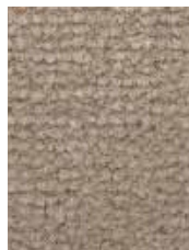
1990 Linen Canvas