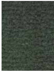
1661 Jade Dust