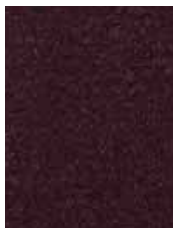
1119 Rich Eggplant