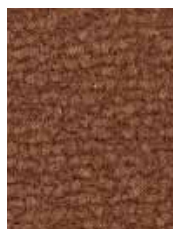
1886 Dijon Spice