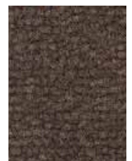
1996 Earthen Jute