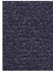
1664 Sapphire Indigo