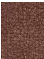
1884 Pottery Barn