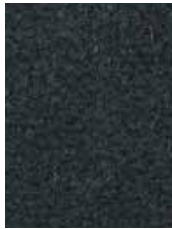
1662 Organic Aqua