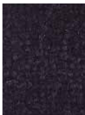
1669 India Ink