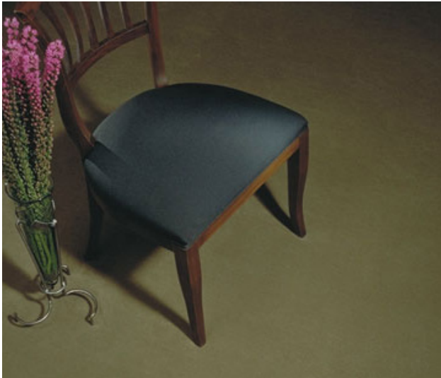
Preview II 30