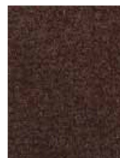
1994 Tobacco Leaf