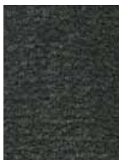
1668 Fern Fields