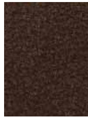
1556 Bronze Verde