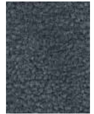
1667 Blue Print