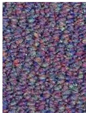
3667 Chameleon Mix