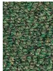
3559 Lichen Boulder