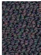
3558 Earth Forest