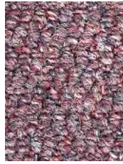
3881 Mineral Ore