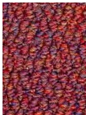
3118 Forest Berry