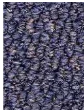
3669 Indigo Batik