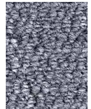
3778 Rain Cloud