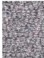
3772 Fossil Grey