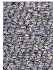
3665 Aztec Sky