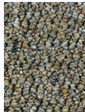
3771 Pebble Beach