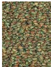
3553 Prairie Bloom