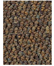
3887 Brushed Suede