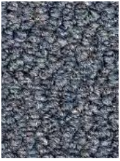
3799 Stormy Peak