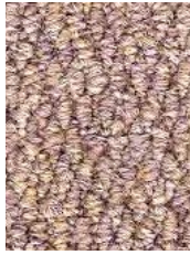
3880 Birch Bark