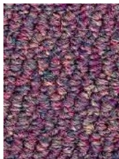
3114 Grape Vineyard