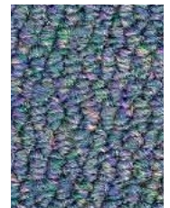
3666 Arctic Ice