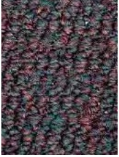
3888 Timber Ridge