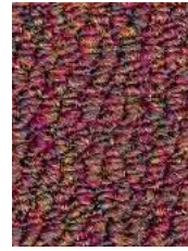
3886 Rustic Cordovan