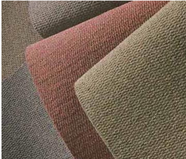
College Park 28