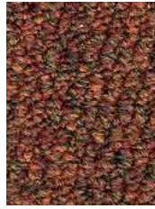
3883 Mesa Clay