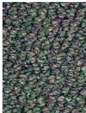
3668 Glacial Blue