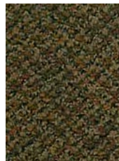
7631 Joshua Tree