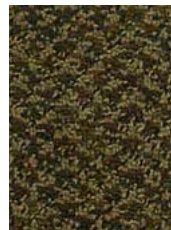
7634 Landscape Garden