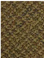
7732 Natural Resources