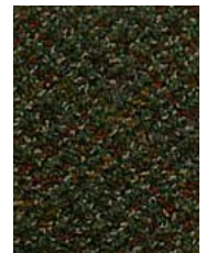
7653 Valley Point