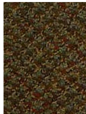
7853 Woodcliff Corral