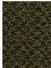
7944 Mountain Scape