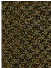
7845 Desert Oasis