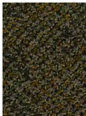
7548 Midwest Sunset