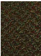
7351 Vineyard Terrace