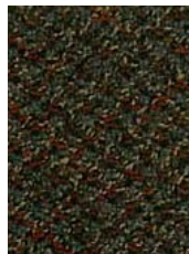
7553 Aerosphere Sky