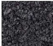
7719 Carbon Char