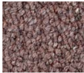
7816 Smoke Signal