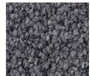
7714 Silvery Nickel