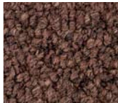
7881 Coconut Shell