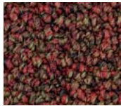
7388 Sundried Tomato