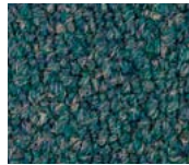
7408 Viridian Sea