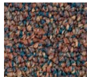
7565 Mineral Quartz