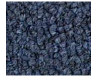
7509 Blueprint Ink