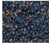
7559 Anodized Lapis