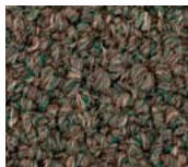
7866 Earthed Fields