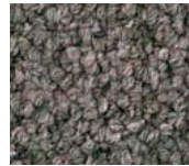
7627 Ash Bark