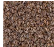
7837 Biscotti Crunch