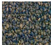
7628 Herbal Wasabi